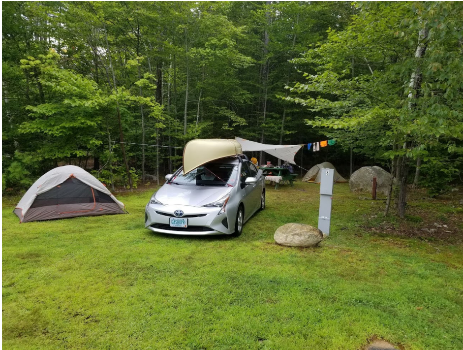
The (my) campsite #8

* Asterisk note: Campsite don't have fireplaces but offer complete trailer hookups. (water/electric & with semi shade)