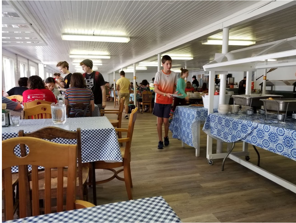
A Fine Lunch in the Cafeteria